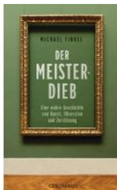
Der Meisterdieb Ladenpreis: 24,70EUR