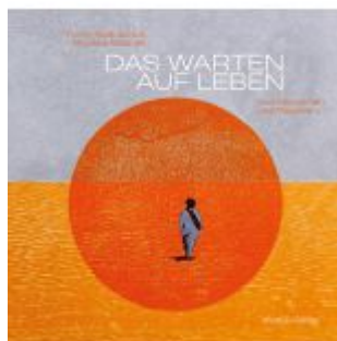
Das Warten auf Leben Ladenpreis: 24,70EUR