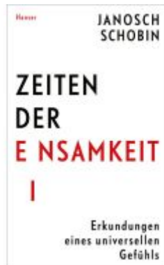
Zeiten der Einsamkeit Ladenpreis: 23,70EUR