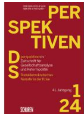
Sozialdemokratisches Narrativ in der Krise Ladenpreis: 17,40EUR