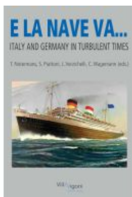
E LA NAVE VA Ladenpreis: 21,90EUR