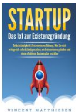
STARTUP: Das 1x1 zur Existenzgründung, Selbstständigkeit & Unternehmensführung. Wie Sie sich erfolgreich selbstständig machen, ein Unternehmen gründen und einen effektiven Businessplan erstellen Ladenpreis: 16,40EUR