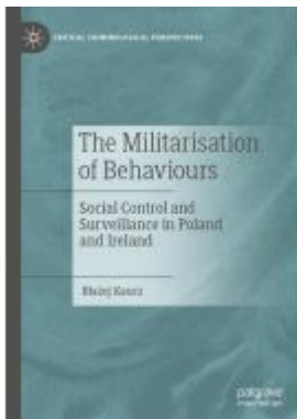
The Militarisation of Behaviours Ladenpreis: 131,99EUR

Wir haben andere Produkte gefunden, die Ihnen gefallen könnten!