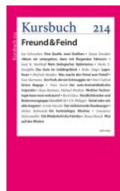
Kursbuch 214 Ladenpreis: 16,40EUR