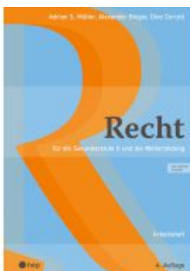
Recht Arbeitsheft (Print inkl. E-Book Edubase, Neuauflage 2025) Ladenpreis: 30,90EUR