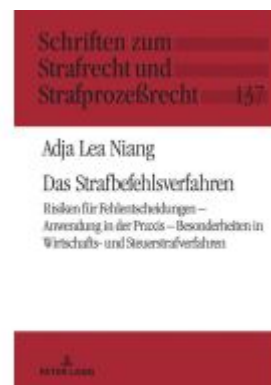
Das Strafbefehlsverfahren Ladenpreis: 123,30EUR