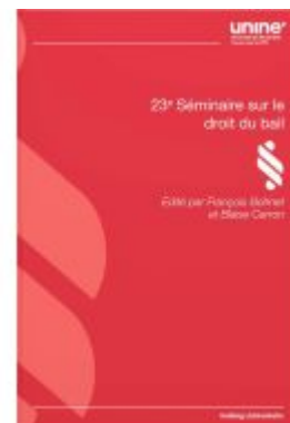
23e Séminaire sur le droit du bail Ladenpreis: 86,00EUR