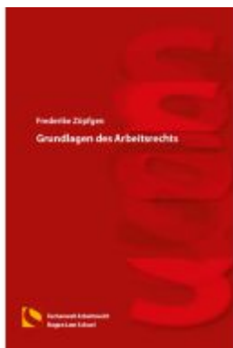
Grundlagen des Arbeitsrechts