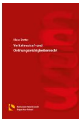
Verkehrsstraf- und Ordnungswidrigkeitenrecht Ladenpreis: 60,60EUR