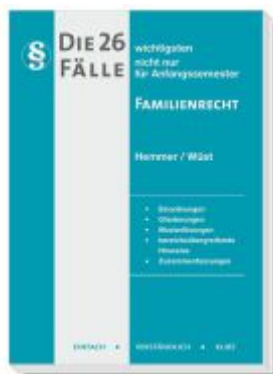
Die 26 wichtigsten Fälle Familienrecht Ladenpreis: 16,40EUR