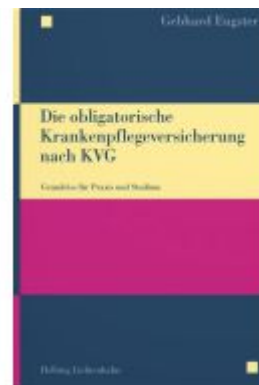
Die obligatorische Krankenpflegeversicherung nach KVG