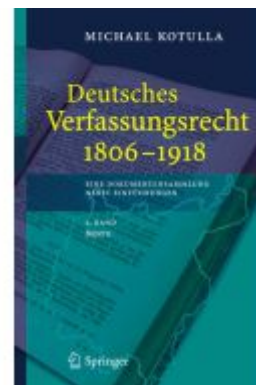
Deutsches Verfassungsrecht 1806 - 1918 Ladenpreis: 287,84EUR