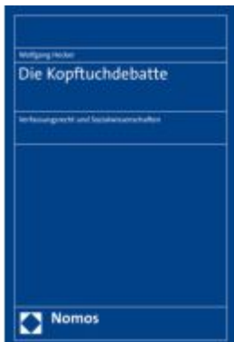
Die Kopftuchdebatte Ladenpreis: 86,40EUR

Wir haben andere Produkte gefunden, die Ihnen gefallen könnten!