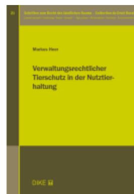
Verwaltungsrechtlicher Tierschutz in der Nutztierhaltung Ladenpreis: 104,00EUR