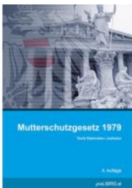
Mutterschutzgesetz 1979 Ladenpreis: 26,00EUR