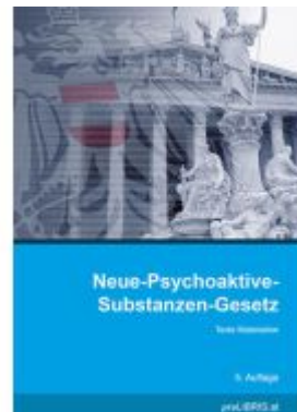
Neue-Psychoaktive-Substanzen-Gesetz Ladenpreis: 13,00EUR