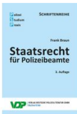
Staatsrecht für Polizeibeamte Ladenpreis: 22,70EUR