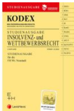
KODEX Insolvenz- und Wettbewerbsrecht 2022 - inkl. App Ladenpreis: 19,00EUR