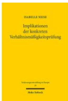
Implikationen der konkreten Verhältnismäßigkeitsprüfung Ladenpreis: 81,30EUR