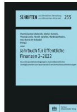
Jahrbuch für öffentliche Finanzen (2022) 2 Ladenpreis: 42,20EUR