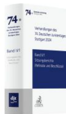
Verhandlungen des 74. Deutschen Juristentages Stuttgart 2024 Band II/1: Sitzungsberichte - Referate und Beschlüsse Ladenpreis: 173,80EUR