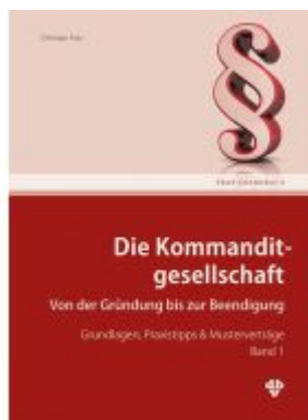
Die Kommanditgesellschaft Band 1 Ladenpreis: 78,00EUR