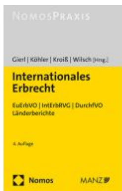
Internationales Erbrecht Ladenpreis: 132,00EUR