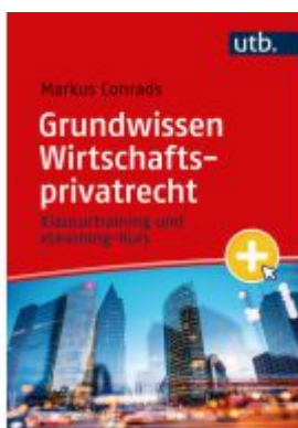
Grundwissen Wirtschaftsprivatrecht Ladenpreis: 30,80EUR