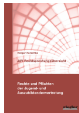
JAV Rechtsprechungsübersicht Ladenpreis: 24,70EUR