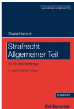
Strafrecht Allgemeiner Teil Ladenpreis: 35,00EUR