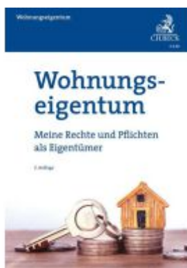
Wohnungseigentum Ladenpreis: 8,20EUR