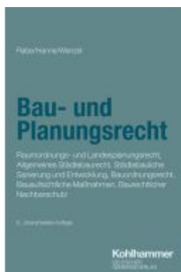
Bau- und Planungsrecht Ladenpreis: 60,70EUR