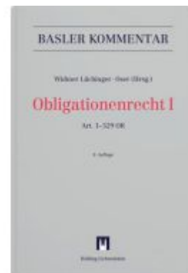
Obligationenrecht I Ladenpreis: 713,00EUR