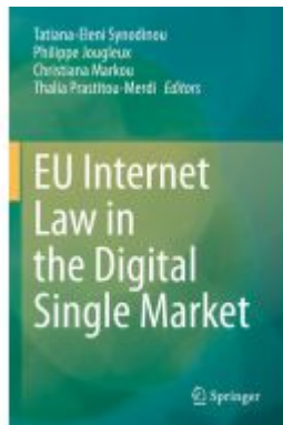
EU Internet Law in the Digital Single Market Ladenpreis: 252,99EUR