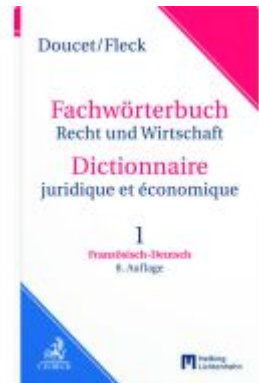
Wörterbuch Recht- und Wirtschaft Dictionnaire juridique et économique, Teil I: Französisch-Deutsch Ladenpreis: 109,00EUR