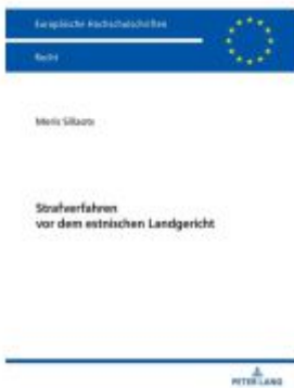
Strafverfahren vor dem estnischen Landgericht Ladenpreis: 41,10EUR