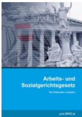
Arbeits- und Sozialgerichtsgesetz Ladenpreis: 26,00EUR