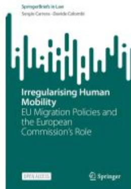
Irregularising Human Mobility Ladenpreis: 54,99EUR