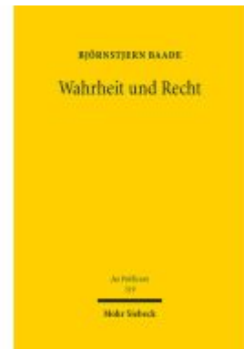
Wahrheit und Recht Ladenpreis: 148,10EUR