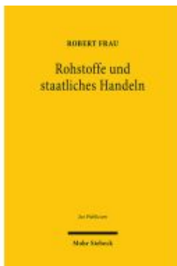
Rohstoffe und staatliches Handeln Ladenpreis: 138,80EUR