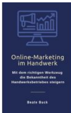
Online-Marketing im Handwerk Ladenpreis: 13,30EUR