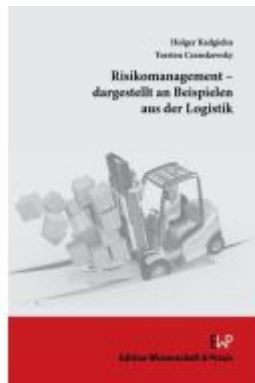
Risikomanagement – dargestellt an Beispielen aus der Logistik Ladenpreis: 51,30EUR