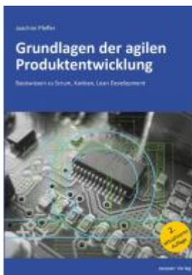
Grundlagen der agilen Produktentwicklung Ladenpreis: 12,40EUR