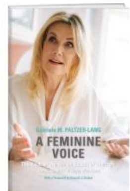
A Feminine Voice Ladenpreis: 49,00EUR