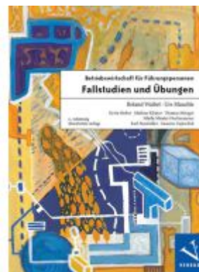
Betriebswirtschaft für Führungspersonen: Fallstudien und Übungen Ladenpreis: 32,00EUR