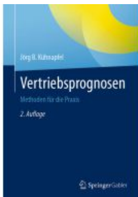
Vertriebsprognosen Ladenpreis: 56,53EUR