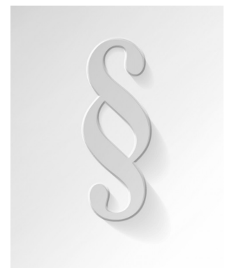
Navigating Sustainable Development Governance in times of Polycrisis Ladenpreis: 32,99EUR