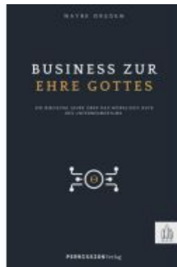
Business zur Ehre Gottes Ladenpreis: 14,40EUR