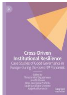
Cross-Driven Institutional Resilience Ladenpreis: 175,99EUR