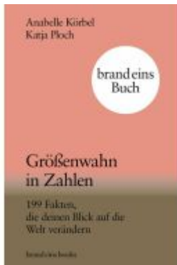
Größenwahn in Zahlen Ladenpreis: 20,60EUR

Wir haben andere Produkte gefunden, die Ihnen gefallen könnten!