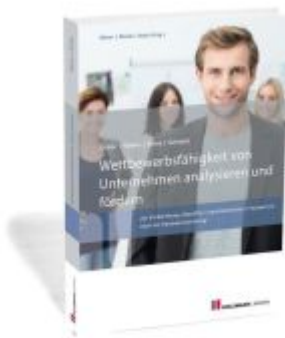
Wettbewerbsfähigkeit von Unternehmen analysieren und fördern Ladenpreis: 34,90EUR