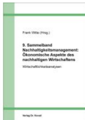
9. Sammelband Nachhaltigkeitsmanagement: Ökonomische Aspekte des nachhaltigen Wirtschaftens Ladenpreis: 76,90EUR