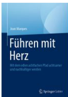
Führen mit Herz Ladenpreis: 39,06EUR