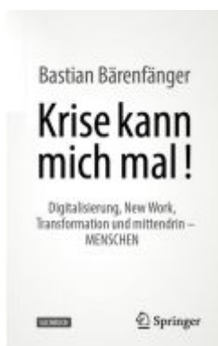
Krise kann mich mal! Ladenpreis: 28,77EUR