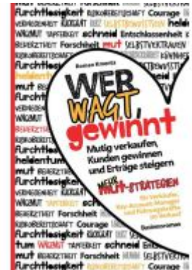
Wer wagt, gewinnt Ladenpreis: 19,97EUR