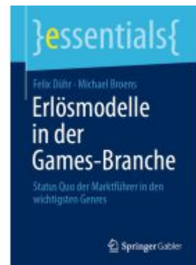
Erlösmodelle in der Games-Branche Ladenpreis: 15,41EUR