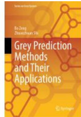
Grey Prediction Methods and Their Applications Ladenpreis: 120,99EUR