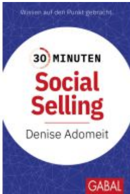
30 Minuten Social Selling Ladenpreis: 11,30EUR