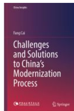
Challenges and Solutions to China's Modernization Process Ladenpreis: 142,99EUR