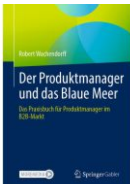
Der Produktmanager und das Blaue Meer Ladenpreis: 61,67EUR

Wir haben andere Produkte gefunden, die Ihnen gefallen könnten!