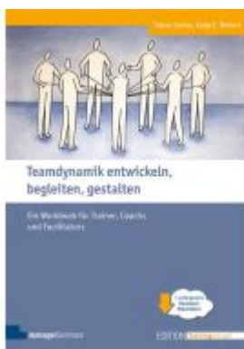
Teamdynamik entwickeln, begleiten, gestalten Ladenpreis: 51,30EUR