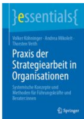
Praxis der Strategiearbeit in Organisationen Ladenpreis: 15,41EUR