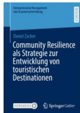
Community Resilience als Strategie zur Entwicklung von touristischen Destinationen Ladenpreis: 82,24EUR