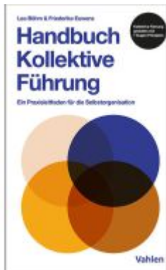
Handbuch kollektive Führung Ladenpreis: 35,90EUR

Wir haben andere Produkte gefunden, die Ihnen gefallen könnten!