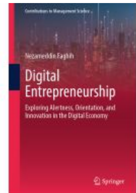
Digital Entrepreneurship Ladenpreis: 186,99EUR