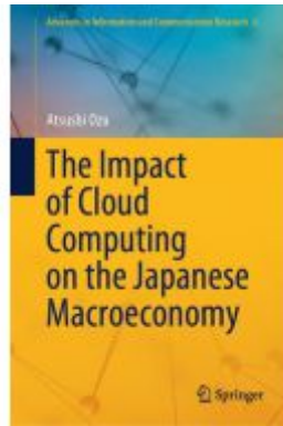
The Impact of Cloud Computing on the Japanese Macroeconomy Ladenpreis: 142,99EUR