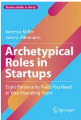
Archetypical Roles in Startups Ladenpreis: 82,49EUR