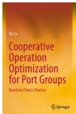
Cooperative Operation Optimization for Port Groups Ladenpreis: 153,99EUR