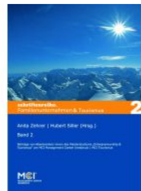
schriftenreihe Familienunternehmen & Tourismus Ladenpreis: 19,90EUR