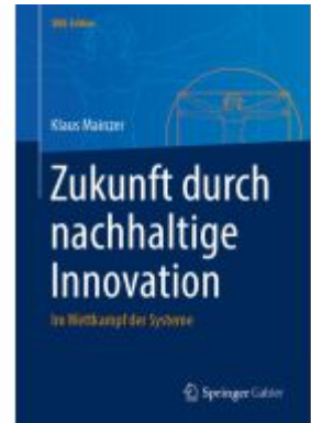
Zukunft durch nachhaltige Innovation Ladenpreis: 56,53EUR