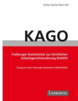
Handbuch KAGO-Kommentar Ladenpreis: 29,90EUR