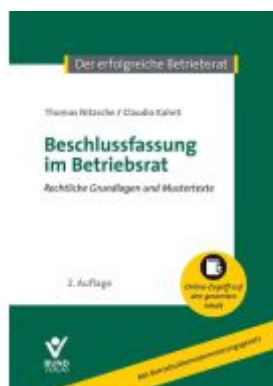
Beschlussfassung im Betriebsrat Ladenpreis: 43,20EUR