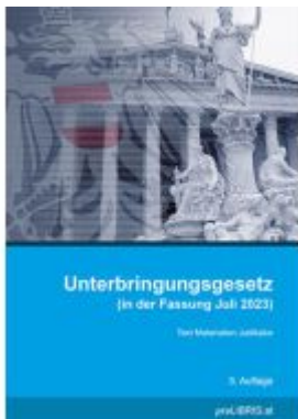
Unterbringungsgesetz (idF Juli 2023) Ladenpreis: 26,00EUR

Wir haben andere Produkte gefunden, die Ihnen gefallen könnten!