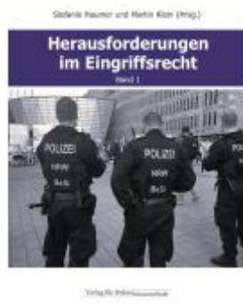
Herausforderungen im Eingriffsrecht Ladenpreis: 29,80EUR