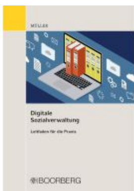
Digitale Sozialverwaltung Ladenpreis: 35,80EUR