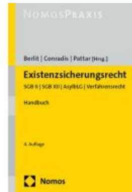
Existenzsicherungsrecht Ladenpreis: 153,20EUR