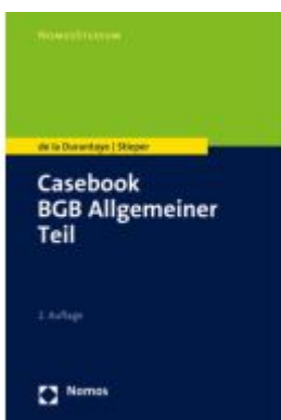
Casebook BGB Allgemeiner Teil Ladenpreis: 26,70EUR