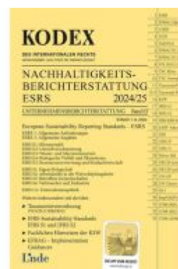
KODEX Nachhaltigkeitsberichterstattung - ERS Ladenpreis: 35,00EUR