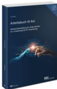
Arbeitsbuch AI Act Ladenpreis: 50,40EUR