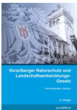
Vorarlberger Naturschutz und Landschaftsentwicklung-Gesetz Ladenpreis: 26,00EUR