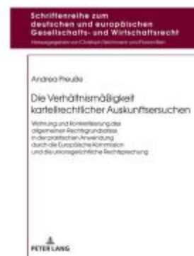
Die Verhältnismäßigkeit kartellrechtlicher Auskunftersuchen Ladenpreis: 68,80EUR