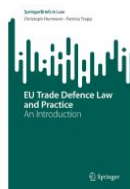
EU Trade Defence Law and Practice Ladenpreis: 54,99EUR