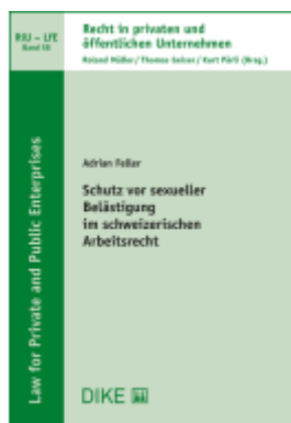
Schutz vor sexueller Belästigung im schweizerischen Arbeitsrecht Ladenpreis: 52,00EUR