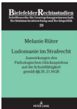
Ludomanie im Strafrecht Ladenpreis: 61,60EUR

Wir haben andere Produkte gefunden, die Ihnen gefallen könnten!