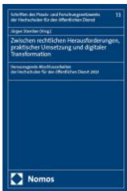
Zwischen rechtlichen Herausforderungen, praktischer Umsetzung und digitaler Transformation Ladenpreis: 101,80EUR