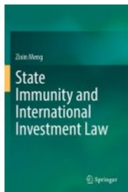
State Immunity and International Investment Law Ladenpreis: 142,99EUR