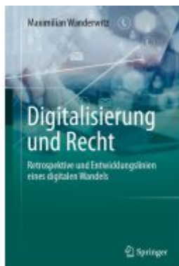
Digitalisierung und Recht Ladenpreis: 51,39EUR