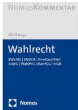
Wahlrecht Ladenpreis: 172,80EUR