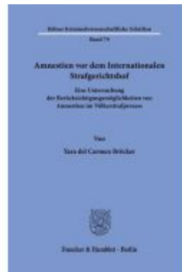
Amnestien vor dem Internationalen Strafgerichtshof Ladenpreis: 102,70EUR