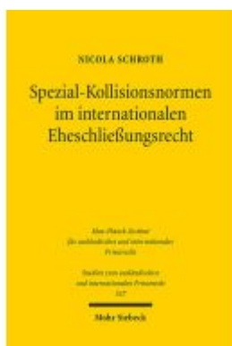
Spezial-Kollisionsnormen im internationalen Eheschließungsrecht Ladenpreis: 96,70EUR