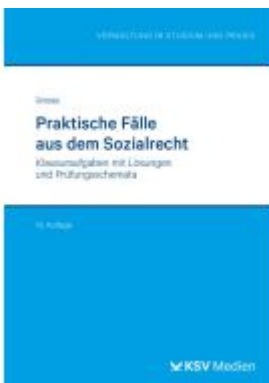
Praktische Fälle aus dem Sozialrecht Ladenpreis: 26,80EUR