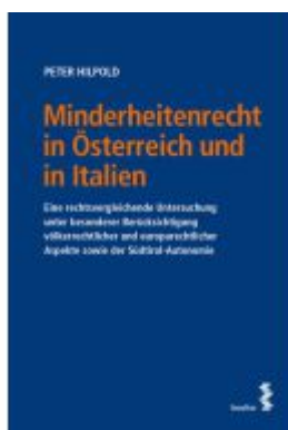
Minderheitenrecht in Österreich und in Italien Ladenpreis: 80,00EUR