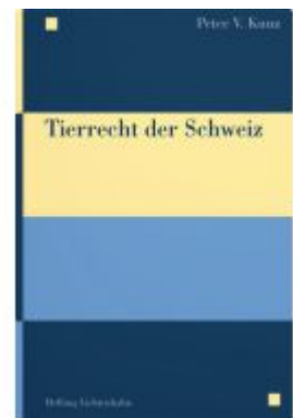
Tierrecht der Schweiz Ladenpreis: 163,00EUR