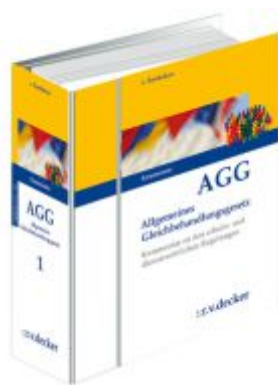
Allgemeines Gleichbehandlungsgesetz - AGG Ladenpreis: 552,10EUR