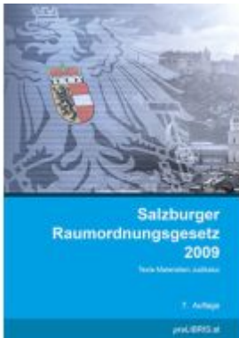
Salzburger Raumordnungsgesetz 2009 Ladenpreis: 32,00EUR

Wir haben andere Produkte gefunden, die Ihnen gefallen könnten!