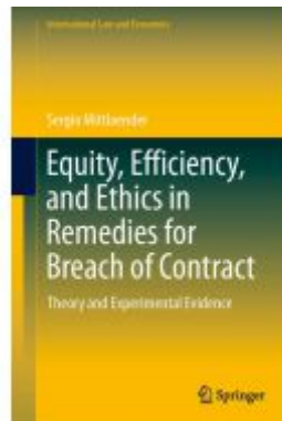
Equity, Efficiency, and Ethics in Remedies for Breach of Contract Ladenpreis: 131,99EUR