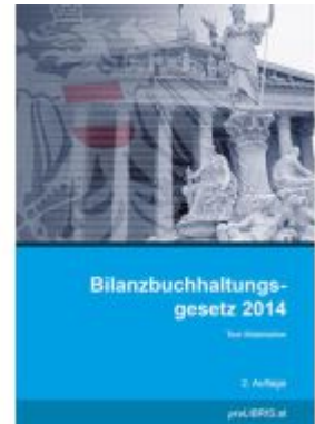
Bilanzbuchhaltungsgesetz 2014 Ladenpreis: 23,00EUR