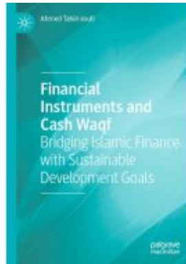
Financial Instruments and Cash Waqf Ladenpreis: 153,99EUR