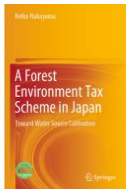
A Forest Environment Tax Scheme in Japan Ladenpreis: 120,99EUR