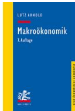
Makroökonomik Ladenpreis: 40,10EUR