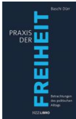
Praxis der Freiheit Ladenpreis: 22,70EUR