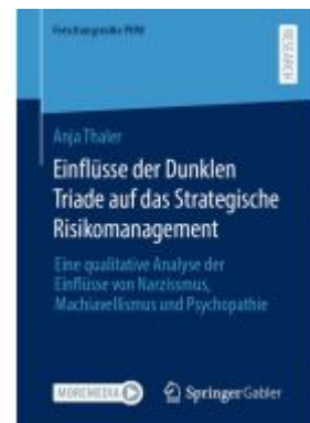
Einflüsse der Dunklen Triade auf das Strategische Risikomanagement Ladenpreis: 71,95EUR