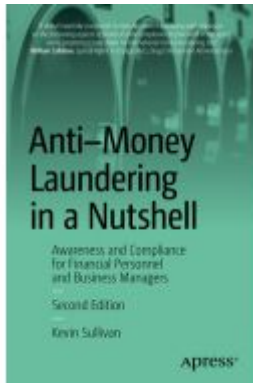
Anti-Money Laundering in a Nutshell Ladenpreis: 25,29EUR