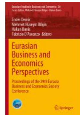
Eurasian Business and Economics Perspectives Ladenpreis: 252,99EUR