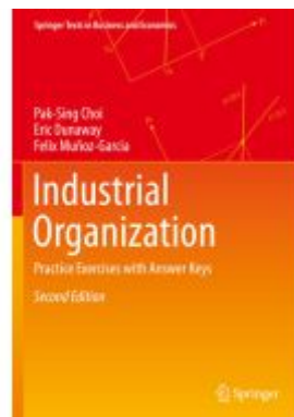
Industrial Organization Ladenpreis: 109,99EUR