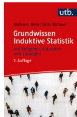
Grundwissen Induktive Statistik Ladenpreis: 25,60EUR