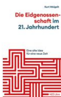
Die Eidgenossenschaft im 21. Jahrhundert Ladenpreis: 28,80EUR