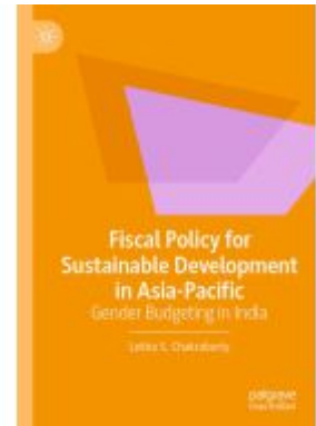
Fiscal Policy for Sustainable Development in Asia-Pacific Ladenpreis: 131,99EUR