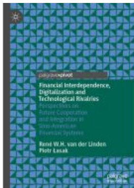
Financial Interdependence, Digitalization and Technological Rivalries Ladenpreis: 49,49EUR