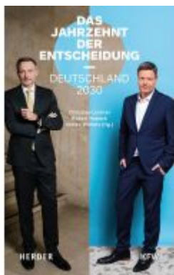
Das Jahrzehnt der Entscheidung Ladenpreis: 25,80EUR