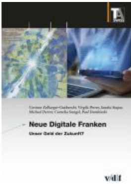
Neue Digitale Franken Ladenpreis: 54,00EUR