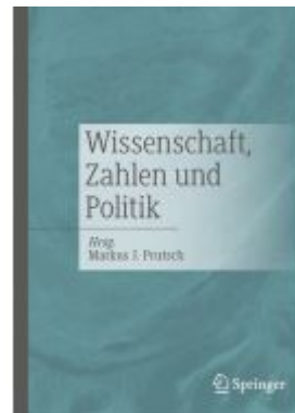
Wissenschaft, Zahlen und Politik Ladenpreis: 123,35EUR