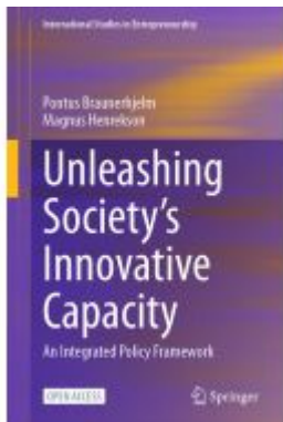
Unleashing Society's Innovative Capacity Ladenpreis: 54,99EUR