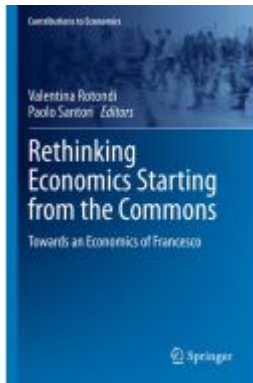
Rethinking Economics Starting from the Commons Ladenpreis: 164,99EUR