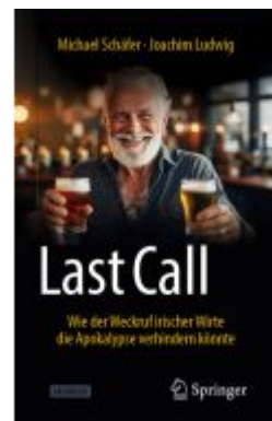
Last Call Ladenpreis: 25,69EUR