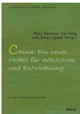
Chinas neue Strategie für langfristiges Wachstum und Entwicklung Ladenpreis: 43,10EUR