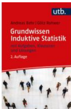
Grundwissen Induktive Statistik Ladenpreis: 25,60EUR

Wir haben andere Produkte gefunden, die Ihnen gefallen könnten!