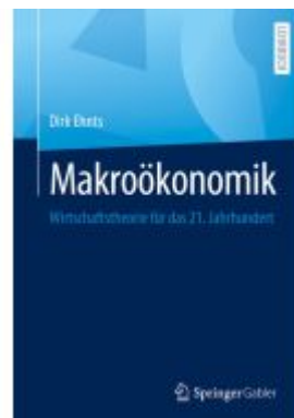
Makroökonomik Ladenpreis: 35,97EUR