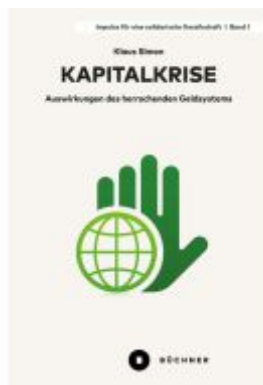
Kapitalkrise Ladenpreis: 15,00EUR