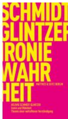
Ironie und Wahrheit Ladenpreis: 16,50EUR