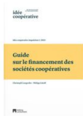
Guide sur le financement des sociétés coopératives Ladenpreis: 42,00EUR