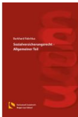
Sozialversicherungsrecht – Allgemeiner Teil Ladenpreis: 25,70EUR