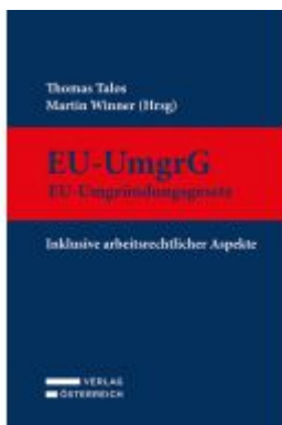
EU-UmgrG - EU-Umgründungsgesetz Ladenpreis: 268,00EUR