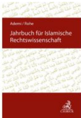
Jahrbuch für Islamische Rechtswissenschaft Ladenpreis: 91,50EUR