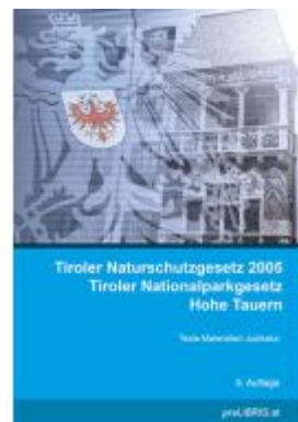
Tiroler Naturschutzgesetz 2005 Tiroler Nationalparkgesetz Hohe Tauern Ladenpreis: 28,00EUR