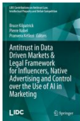
Antitrust in Data Driven Markets & Legal Framework for Influencers, Native Advertising and Control over the Use of AI in Marketing Ladenpreis: 252,99EUR