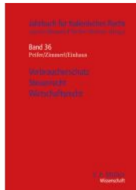
Verbraucherschutz - Steuerrecht - Wirtschaftsrecht Ladenpreis: 123,40EUR