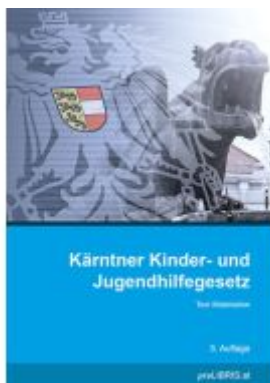
Kärntner Kinder- und Jugendhilfegesetz Ladenpreis: 23,00EUR