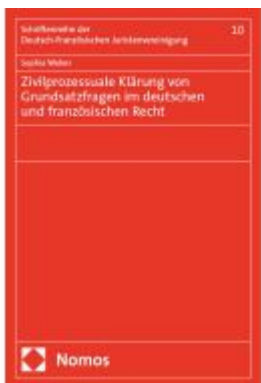
Zivilprozessuale Klärung von Grundsatzfragen im deutschen und französischen Recht Ladenpreis: 96,70EUR