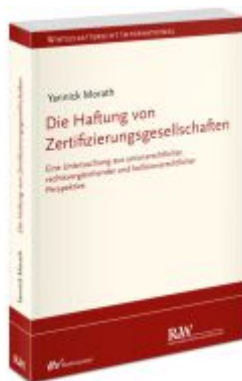
Die Haftung von Zertifizierungsgesellschaften Ladenpreis: 91,50EUR