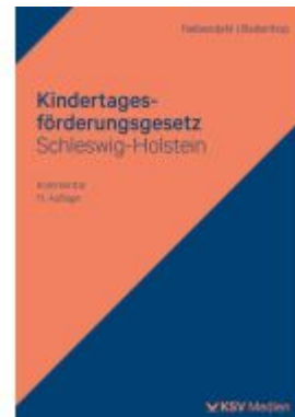
Kindertagesförderungsgesetz Schleswig- Holstein Ladenpreis: 60,70EUR