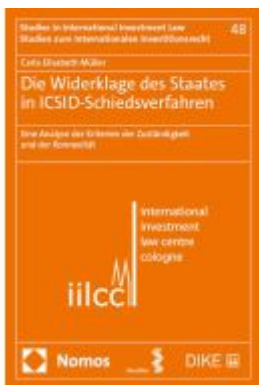
Die Widerklage des Staates in ICSID-Schiedsverfahren Ladenpreis: 153,20EUR