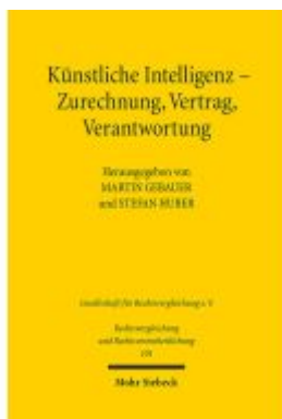
Künstliche Intelligenz - Zurechnung, Vertrag, Verantwortung Ladenpreis: 60,70EUR