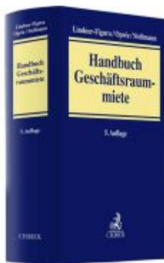
Handbuch Geschäftsraum-miete Ladenpreis: 173,80EUR