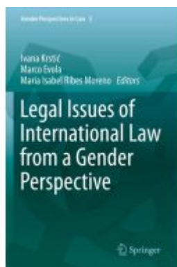
Legal Issues of International Law from a Gender Perspective Ladenpreis: 175,99EUR