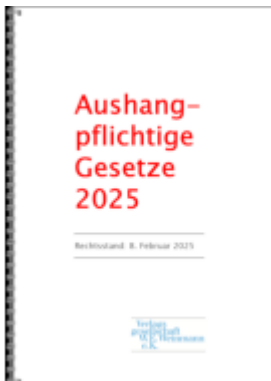
Aushangpflichtige Gesetze 2025 Ladenpreis: 12,90EUR

Wir haben andere Produkte gefunden, die Ihnen gefallen könnten!