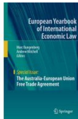
The Australia-European Union Free Trade Agreement Ladenpreis: 164,99EUR