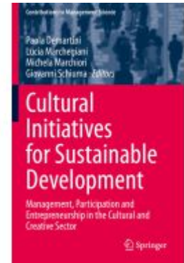
Cultural Initiatives for Sustainable Development Ladenpreis: 153,99EUR