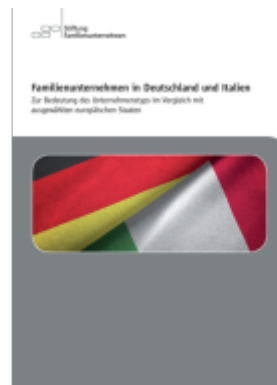
Familienunternehmen in Deutschland und Italien Ladenpreis: 20,50EUR