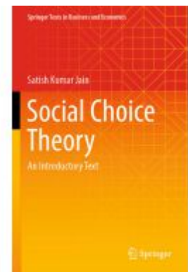
Social Choice Theory Ladenpreis: 71,49EUR