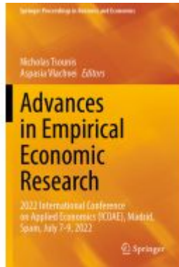
Advances in Empirical Economic Research Ladenpreis: 241,99EUR

Wir haben andere Produkte gefunden, die Ihnen gefallen könnten!