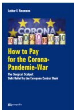
How to Pay for the Corona-Pandemie-War Ladenpreis: 13,20EUR