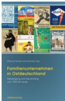
Familienunternehmen in Ostdeutschland Ladenpreis: 35,00EUR