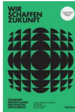
Nachhaltig erfolgreich Ladenpreis: 30,70EUR