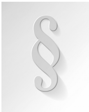
Essentials on Dynamic Capabilities for a Contemporary World Ladenpreis: 175,99EUR