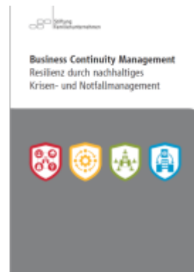
Kompendium - Business Continuity Management Ladenpreis: 10,20EUR