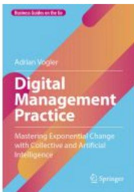
Digital Management Practice Ladenpreis: 38,49EUR