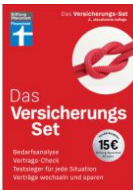
Das Versicherungs-Set Ladenpreis: 15,50EUR