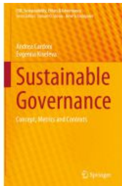
Sustainable Governance Ladenpreis: 131,99EUR

Wir haben andere Produkte gefunden, die Ihnen gefallen könnten!