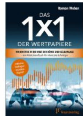
Das 1x1 der Wertpapiere Ladenpreis: 39,60EUR