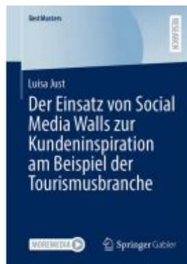
Der Einsatz von Social Media Walls zur Kundeninspiration am Beispiel der Tourismusbranche Ladenpreis: 71,95EUR