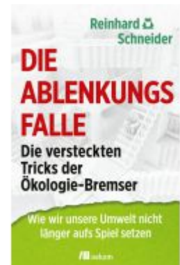
Die Ablenkungsfalle Ladenpreis: 25,70EUR