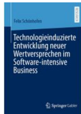
Technologieinduzierte Entwicklung neuer Wertversprechen im Software-intensive Business Ladenpreis: 66,81EUR