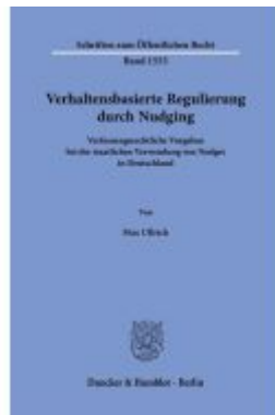
Verhaltensbasierte Regulierung durch Nudging Ladenpreis: 102,70EUR