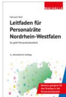
Leitfaden für Personalräte Nordrhein-Westfalen Ladenpreis: 36,00EUR