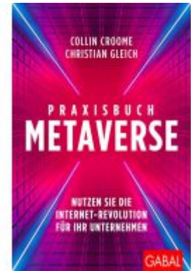
Praxisbuch Metaverse Ladenpreis: 35,90EUR