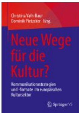
Neue Wege für die Kultur? Ladenpreis: 71,95EUR