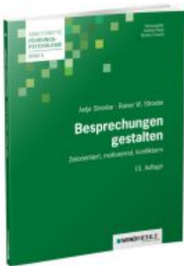
Besprechungen gestalten Ladenpreis: 20,10EUR