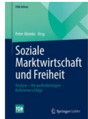
Soziale Marktwirtschaft und Freiheit Ladenpreis: 30,83EUR