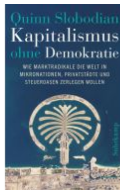
Kapitalismus ohne Demokratie Ladenpreis: 32,90EUR