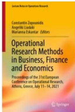
Operational Research Methods in Business, Finance and Economics Ladenpreis: 197,99EUR