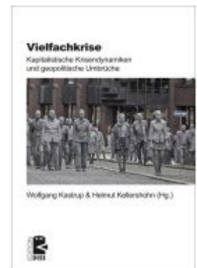
Vielfachkrise Ladenpreis: 20,40EUR