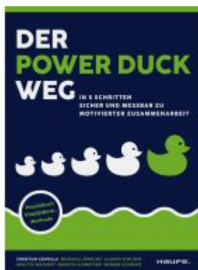
Der Power Duck Weg Ladenpreis: 41,20EUR