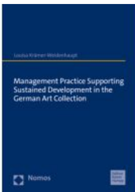
Management Practice Supporting Sustained Development in the German Art Collection Ladenpreis: 60,70EUR