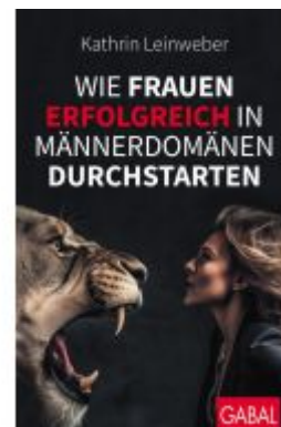
Wie Frauen erfolgreich in Männerdomänen durchstarten Ladenpreis: 28,80EUR