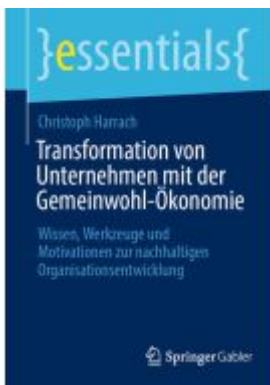
Transformation von Unternehmen mit der Gemeinwohl-Ökonomie Ladenpreis: 15,41EUR