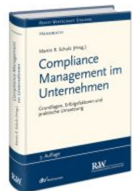
Compliance Management im Unternehmen Ladenpreis: 184,10EUR