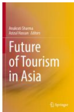
Future of Tourism in Asia Ladenpreis: 197,99EUR