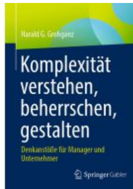
Komplexität verstehen, beherrschen, gestalten Ladenpreis: 41,11EUR