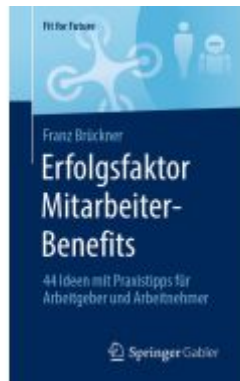
Erfolgsfaktor Mitarbeiter-Benefits Ladenpreis: 20,55EUR