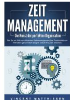
ZEITMANAGEMENT - Die Kunst der perfekten Organisation: Wie Sie mit Hilfe von effizientem Selbstmanagement Ihre Produktivität und Motivation ganz einfach steigern und all Ihre Ziele erreichen Ladenpreis: 16,40EUR