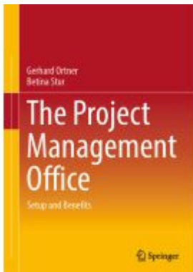
The Project Management Office Ladenpreis: 93,49EUR

Wir haben andere Produkte gefunden, die Ihnen gefallen könnten!