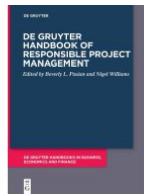
De Gruyter Handbook of Responsible Project Management Ladenpreis: 44,95EUR