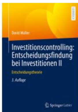
Investitionscontrolling: Entscheidungsfindung bei Investitionen II Ladenpreis: 35,97EUR