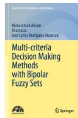
Multi-criteria Decision Making Methods with Bipolar Fuzzy Sets Ladenpreis: 164,99EUR