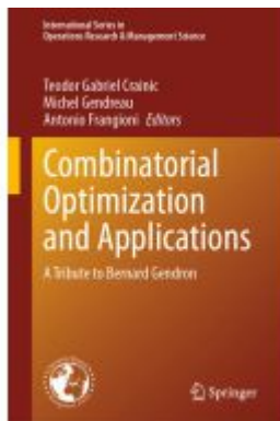
Combinatorial Optimization and Applications Ladenpreis: 186,99EUR