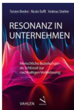
Resonanz in Unternehmen Ladenpreis: 30,70EUR