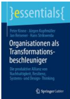
Organisations als Transformationsbeschleuniger Ladenpreis: 15,41EUR