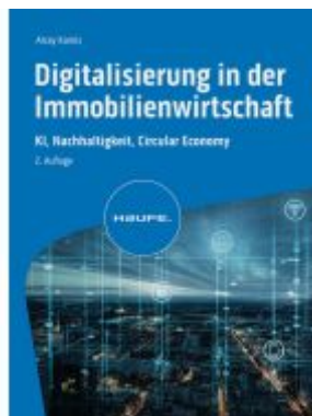
Digitalisierung in der Immobilienwirtschaft Ladenpreis: 72,00EUR