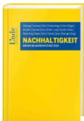
Nachhaltigkeit Ladenpreis: 70,00EUR