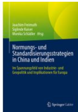
Normungs- und Standardisierungsstrategien in China und Indien Ladenpreis: 77,09EUR