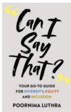
Can I Say That? Ladenpreis: 16,05EUR