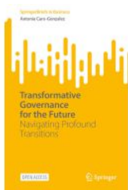
Transformative Governance for the Future Ladenpreis: 32,99EUR