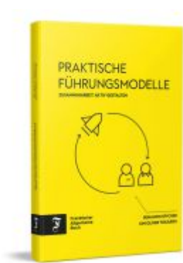
Praktische Führungsmodelle Ladenpreis: 24,70EUR