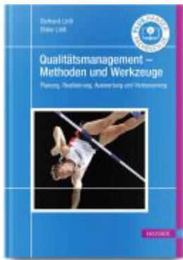
Qualitätsmanagement – Methoden und Werkzeuge Ladenpreis: 102,80EUR

Wir haben andere Produkte gefunden, die Ihnen gefallen könnten!