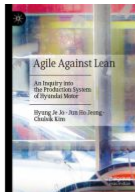
Agile Against Lean Ladenpreis: 142,99EUR