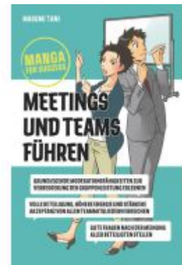
Manga for Success - Meetings und Teams führen Ladenpreis: 22,70EUR