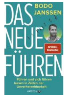
Das neue Führen Ladenpreis: 23,70EUR