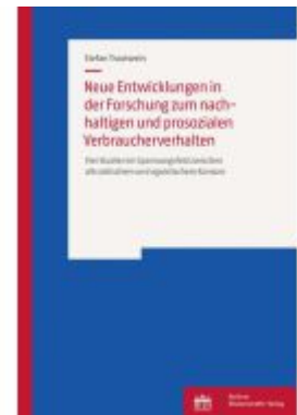
Neue Entwicklungen in der Forschung zum nachhaltigen und prosozialem Verbraucherverhalten Ladenpreis: 39,10EUR