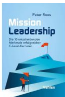
Mission Leadership Ladenpreis: 41,00EUR