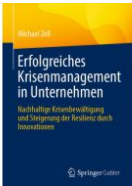
Erfolgreiches Krisenmanagement in Unternehmen Ladenpreis: 35,97EUR

Wir haben andere Produkte gefunden, die Ihnen gefallen könnten!