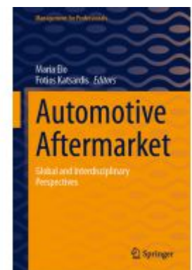
Automotive Aftermarket Ladenpreis: 93,49EUR