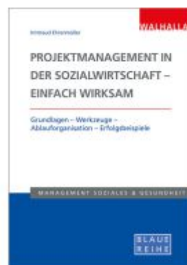
Projektmanagement in der Sozialwirtschaft - einfach wirksam Ladenpreis: 36,00EUR