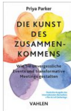
Die Kunst des Zusammenkommens - The Art of Gathering Ladenpreis: 25,60EUR