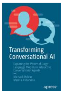
Transforming Conversational AI Ladenpreis: 49,49EUR