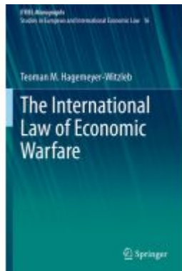
The International Law of Economic Warfare Ladenpreis: 175,99EUR

Wir haben andere Produkte gefunden, die Ihnen gefallen könnten!