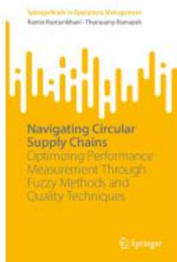
Navigating Circular Supply Chains Ladenpreis: 54,99EUR