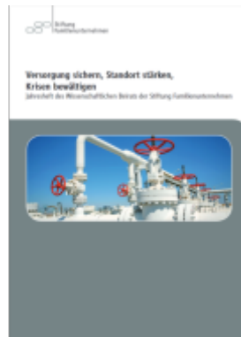
Versorgung sichern, Standort stärken, Krisen bewältigen Ladenpreis: 20,50EUR