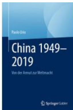
China 1949–2019 Ladenpreis: 102,79EUR