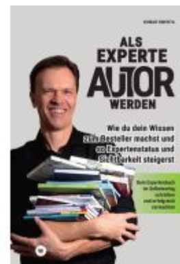
Als Experte Autor werden Ladenpreis: 24,97EUR