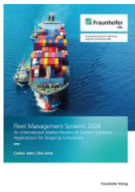
Fleet Management Systems 2024 Ladenpreis: 163,50EUR