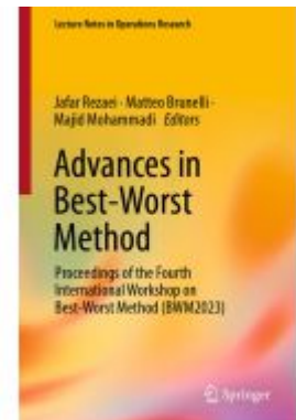
Advances in Best-Worst Method Ladenpreis: 175,99EUR