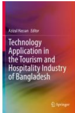
Technology Application in the Tourism and Hospitality Industry of Bangladesh Ladenpreis: 186,99EUR