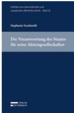
Die Verantwortung des Staates für seine Aktiengesellschaften Ladenpreis: 49,00EUR