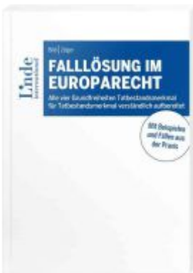
Falllösung im Europarecht Ladenpreis: 30,00EUR

Wir haben andere Produkte gefunden, die Ihnen gefallen könnten!