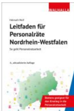
Leitfaden für Personalräte Nordrhein- Westfalen Ladenpreis: 36,00EUR