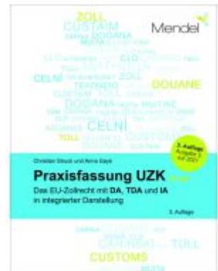
Praxisfassung UZK to go Ladenpreis: 45,20EUR