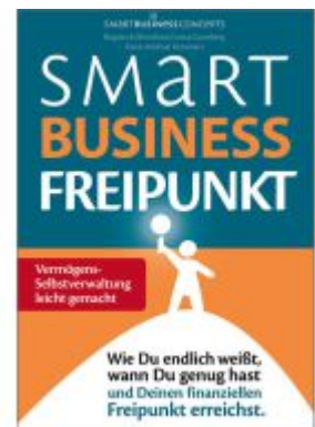
Smart Business Freipunkt Ladenpreis: 29,80EUR