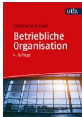
Betriebliche Organisation Ladenpreis: 49,40EUR