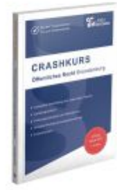
CRASHKURS Öffentliches Recht - Brandenburg Ladenpreis: 27,70EUR