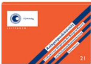
Anlagenproduktivität Ladenpreis: 257,10EUR