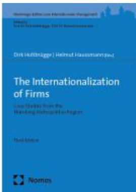
The Internationalization of Firms Ladenpreis: 50,40EUR

Wir haben andere Produkte gefunden, die Ihnen gefallen könnten!