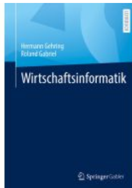
Wirtschaftsinformatik Ladenpreis: 56,53EUR