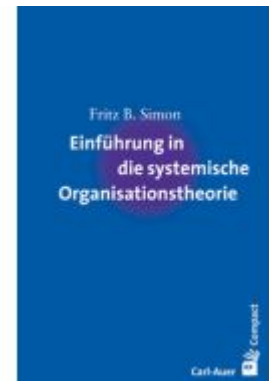
Einführung in die systemische Organisationstheorie Ladenpreis: 19,50EUR