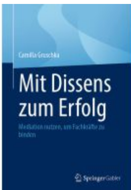
Mit Dissens zum Erfolg Ladenpreis: 46,25EUR