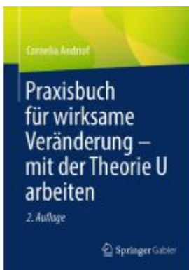
Praxisbuch für wirksame Veränderung – mit der Theorie U arbeiten Ladenpreis: 46,25EUR