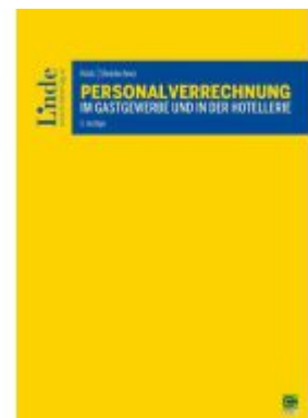
Personalverrechnung im Gastgewerbe und in der Hotellerie Ladenpreis: 60,00EUR