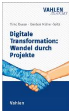
Digitale Transformation: Wandel durch Projekte Ladenpreis: 20,40EUR