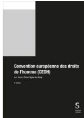
Convention européenne des droits de l'homme (CEDH) Ladenpreis: 346,80EUR