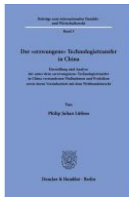
Der "erzwungene" Technologietransfer in China Ladenpreis: 102,70EUR