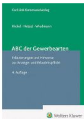
ABC der Gewerbearten Ladenpreis: 30,80EUR