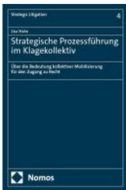
Strategische Prozessführung im Klagekollektiv Ladenpreis: 199,50EUR