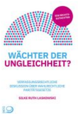
Wächter der Ungleichheit? Ladenpreis: 24,70EUR

Wir haben andere Produkte gefunden, die Ihnen gefallen könnten!