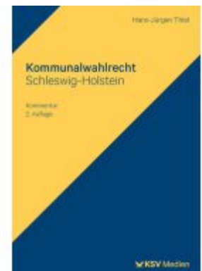
Kommunalwahlrecht Schleswig-Holstein Ladenpreis: 45,30EUR