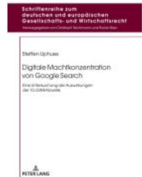
Digitale Machtkonzentration von Google Search Ladenpreis: 71,90EUR