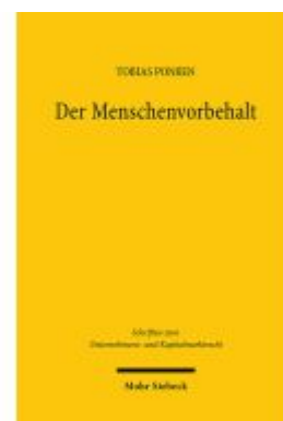
Der Menschenvorbehalt Ladenpreis: 91,50EUR