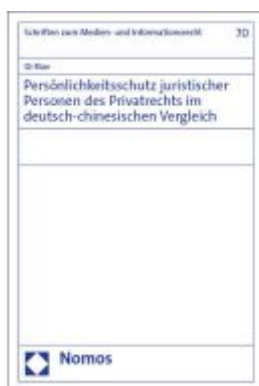
Persönlichkeitsschutz juristischer Personen des Privatrechts im deutsch-chinesischen Vergleich Ladenpreis: 100,80EUR