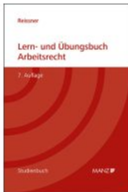
Lern- und Übungsbuch Arbeitsrecht Ladenpreis: 66,00EUR