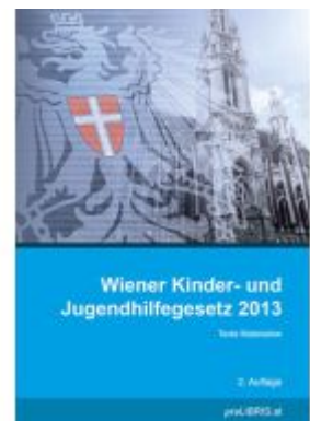
Wiener Kinder- und Jugendhilfegesetz 2013 Ladenpreis: 18,00EUR