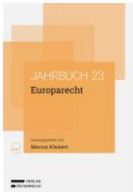
Europarecht Ladenpreis: 78,00EUR

Wir haben andere Produkte gefunden, die Ihnen gefallen könnten!