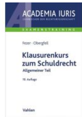
Klausurenkurs zum Schuldrecht Allgemeiner Teil Ladenpreis: 27,70EUR