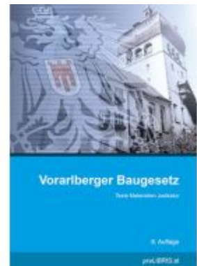
Vorarlberger Baugesetz Ladenpreis: 33,00EUR