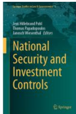
National Security and Investment Controls Ladenpreis: 186,99EUR