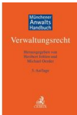
Münchener Anwalts handbuch Verwaltungsrecht Ladenpreis: 225,20EUR