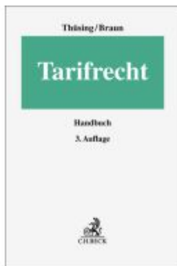
Tarifrecht Ladenpreis: 194,30EUR