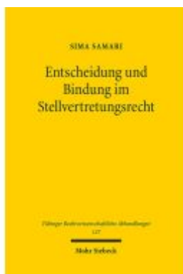
Entscheidung und Bindung im Stellvertretungsrecht Ladenpreis: 86,40EUR