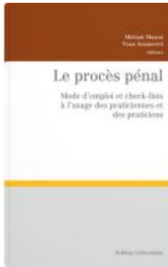
Le procès pénal Ladenpreis: 273,00EUR