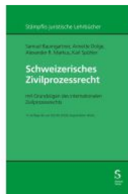
Schweizerisches Zivilprozessrecht Ladenpreis: 175,20EUR