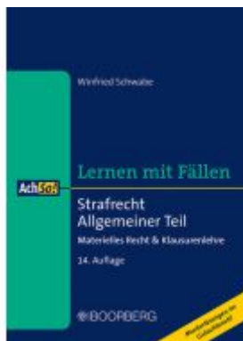
Strafrecht Allgemeiner Teil Ladenpreis: 22,10EUR