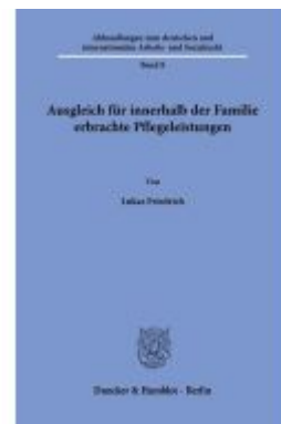
Ausgleich für innerhalb der Familie erbrachte Pflegeleistungen. Ladenpreis: 102,70EUR