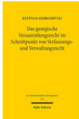
Das georgische Versammlungsrecht im Schnittpunkt von Verfassungs- und Verwaltungsrecht Ladenpreis: 101,80EUR