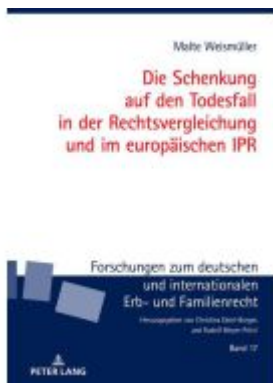
Die Schenkung auf den Todesfall in der Rechtsvergleichung und im europäischen IPR