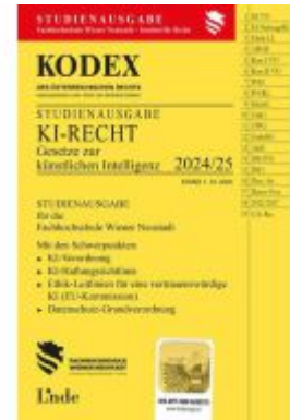
KODEX Studienausgabe KI-Recht 2024/25 Ladenpreis: 24,00EUR