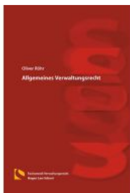
Allgemeines Verwaltungsrecht Ladenpreis: 40,10EUR