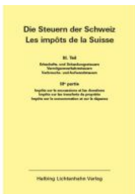
Die Steuern der Schweiz: Teil III EL 144 Ladenpreis: 75,00EUR