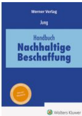
Handbuch Nachhaltige Beschaffung Ladenpreis: 81,30EUR