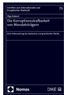
Die Korruptionsstrafbarkeit von Mandatsträgern Ladenpreis: 134,00EUR