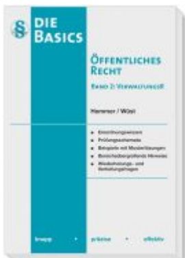
Die Basics Öffentliches Recht - Band 2 Verwaltungsrecht Ladenpreis: 20,50EUR

Wir haben andere Produkte gefunden, die Ihnen gefallen könnten!