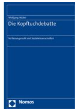
Die Kopftuchdebatte Ladenpreis: 86,40EUR