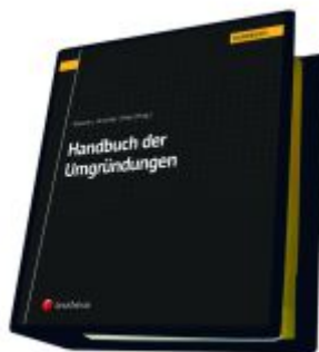
Handbuch der Umgründungen Ladenpreis: 475,00EUR