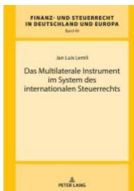
Das Multilaterale Instrument im System des internationalen Steuerrechts Ladenpreis: 66,80EUR