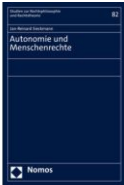
Autonomie und Menschenrechte Ladenpreis: 71,00EUR