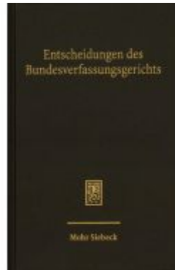
Entscheidungen des Bundesverfassungsgerichts (BVerfGE) Ladenpreis: 55,60EUR