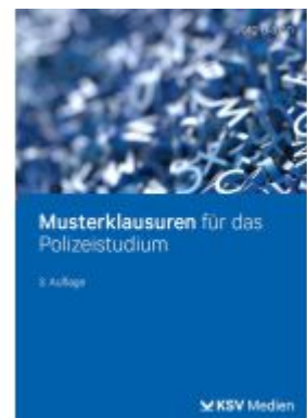
Musterklausuren für das Polizeistudium Ladenpreis: 30,90EUR