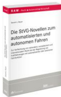
Die StVG-Novellen zum automatisierten und autonomen Fahren Ladenpreis: 91,50EUR