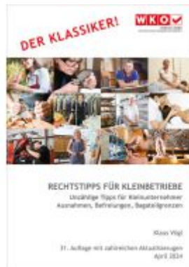
Rechtstipps für Kleinbetriebe Ladenpreis: 32,00EUR