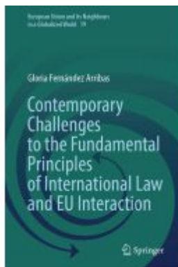
Contemporary Challenges to the Fundamental Principles of International Law and EU Interaction Ladenpreis: 153,99EUR