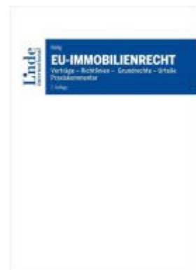
EU-Immobilienrecht Ladenpreis: 52,00EUR