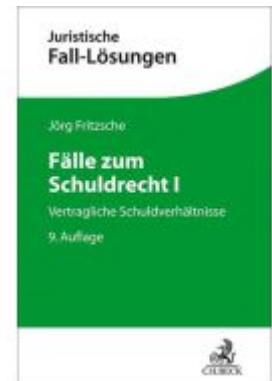
Fälle zum Schuldrecht I Ladenpreis: 27,70EUR