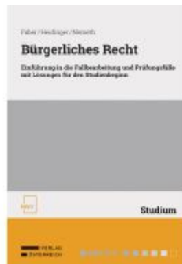
Bürgerliches Recht Ladenpreis: 34,00EUR