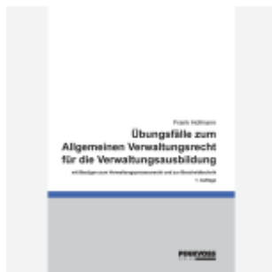
Übungsfälle zum Allgemeinen Verwaltungsrecht für die Verwaltungsbildung Ladenpreis: 23,60EUR