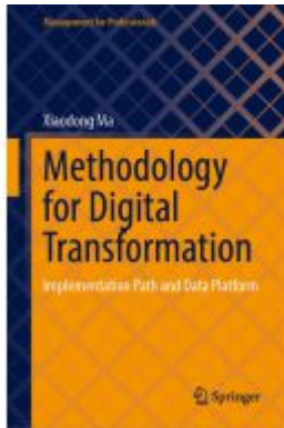
Methodology for Digital Transformation Ladenpreis: 98,99EUR