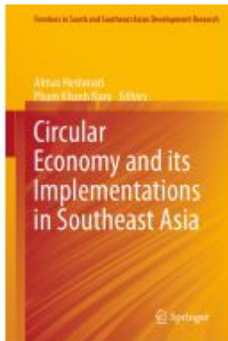
Circular Economy and its Implementations in Southeast Asia Ladenpreis: 186,99EUR