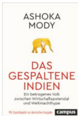
Das gespaltene Indien Ladenpreis: 39,10EUR