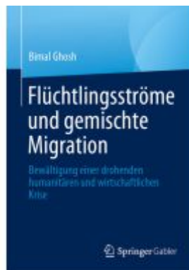
Flüchtlingsströme und gemischte Migration Ladenpreis: 92,51EUR