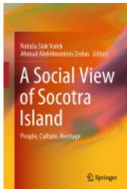
A Social View of Socotra Island Ladenpreis: 175,99EUR

Wir haben andere Produkte gefunden, die Ihnen gefallen könnten!