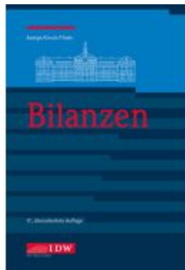
Bilanzen Ladenpreis: 49,40EUR