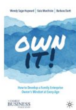
Own It! Ladenpreis: 38,49EUR