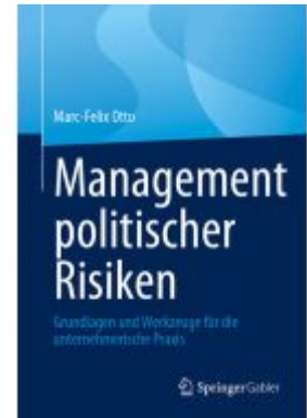
Management politischer Risiken Ladenpreis: 39,06EUR