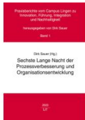
Sechste Lange Nacht der Prozessverbesserung und Organisationsentwicklung Ladenpreis: 34,90EUR