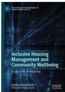
Inclusive Housing Management and Community Wellbeing Ladenpreis: 109,99EUR