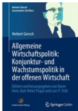
Allgemeine Wirtschaftspolitik: Konjunktur- und Wachstumspolitik in der offenen Wirtschaft Ladenpreis: 61,67EUR