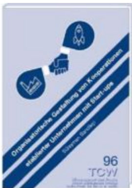
Organisatorische Gestaltung von Kooperationen etablierter Unternehmen mit Start-ups Ladenpreis: 79,44EUR