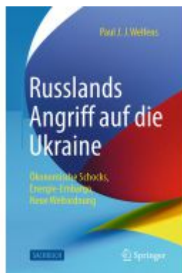
Russlands Angriff auf die Ukraine Ladenpreis: 28,78EUR