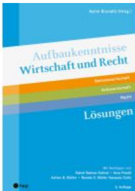
Aufbaukenntnisse Wirtschaft und Recht Lösungen Ladenpreis: 49,40EUR