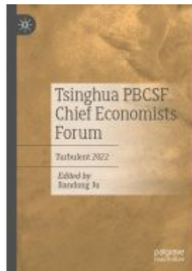
Tsinghua PBCSF Chief Economists Forum Ladenpreis: 43,99EUR