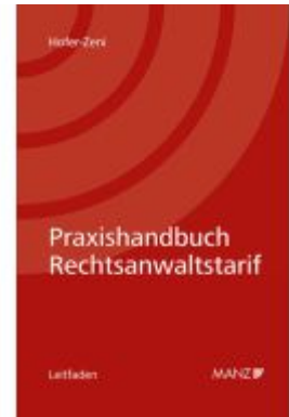
Praxishandbuch Rechtsanwaltstarif Ladenpreis: 44,00EUR