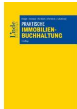
Praktische Immobilienbuchhaltung Ladenpreis: 72,00EUR