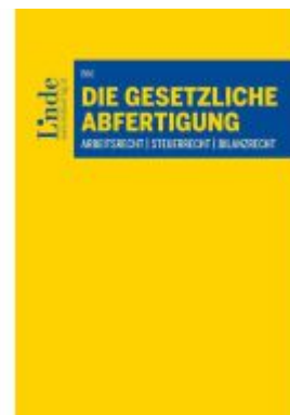
Die gesetzliche Abfertigung Ladenpreis: 29,00EUR

Alle Preise inkl. MwSt. zzgl. Versand. Bei Bestellung im LexisNexis Onlineshop kostenloser Versand innerhalb Österreichs.