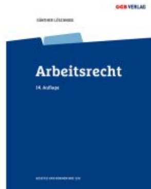
Arbeitsrecht Ladenpreis: 129,00EUR