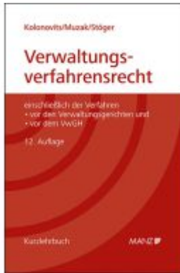
Grundriss des österreichischen Verwaltungsverfahrenrechts Ladenpreis: 76,00EUR