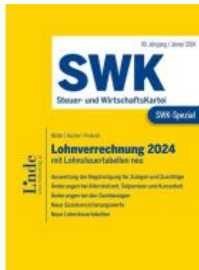
SWK-Spezial Lohnverrechnung 2024 Ladenpreis: 50,00EUR