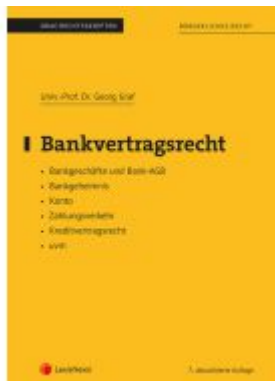
Bankvertragsrecht (Skriptum) Ladenpreis: 29,00EUR

Wir haben andere Produkte gefunden, die Ihnen gefallen könnten!