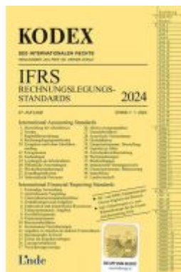
KODEX IFRS - Rechnungslegungsstandards 2024 Ladenpreis: 34,00EUR