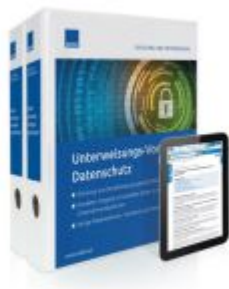
Unterweisungs-Vorlagen Datenschutz Ladenpreis: 239,80EUR