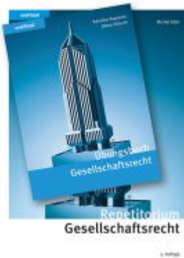
Gesellschaftsrecht Kombipaket Ladenpreis: 82,30EUR