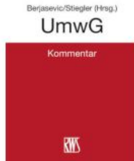
UmwG Ladenpreis: 173,80EUR