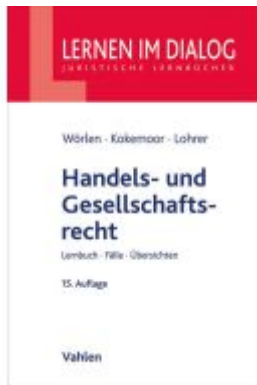
Handels- und Gesellschaftsrecht Ladenpreis: 25,60EUR