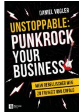
Unstoppable: Punkrock your Business Ladenpreis: 21,99EUR