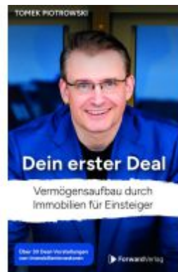
Dein erster Deal Ladenpreis: 20,00EUR