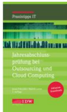
Jahresabschlussprüfung bei Outsourcing und Cloud Computing Ladenpreis: 55,60EUR