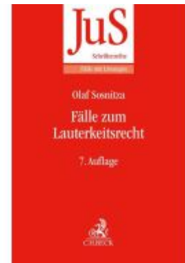
Fälle zum Lauterkeitsrecht Ladenpreis: 30,70EUR