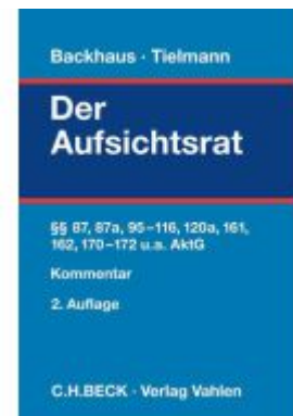
Der Aufsichtsrat Ladenpreis: 338,30EUR