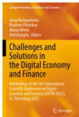
Challenges and Solutions in the Digital Economy and Finance Ladenpreis: 252,99EUR