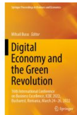
Digital Economy and the Green Revolution Ladenpreis: 219,99EUR