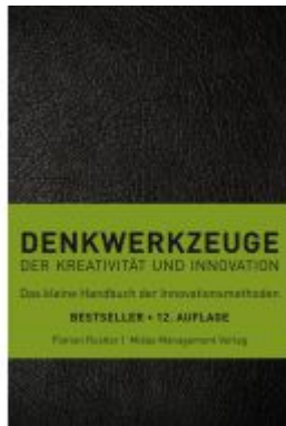
Denkwerkzeuge Ladenpreis: 25,70EUR