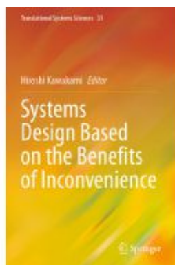
Systems Design Based on the Benefits of Inconvenience Ladenpreis: 164,99EUR