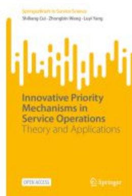
Innovative Priority Mechanisms in Service Operations Ladenpreis: 32,99EUR