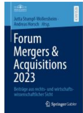
Forum Mergers & Acquisitions 2023 Ladenpreis: 102,79EUR