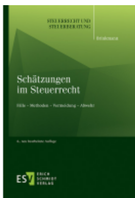
Schätzungen im Steuerrecht Ladenpreis: 92,40EUR