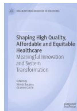
Shaping High Quality, Affordable and Equitable Healthcare Ladenpreis: 186,99EUR