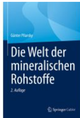
Die Welt der mineralischen Rohstoffe Ladenpreis: 51,39EUR