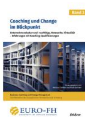
Coaching und Change im Blickpunkt. Band III Ladenpreis: 32,80EUR