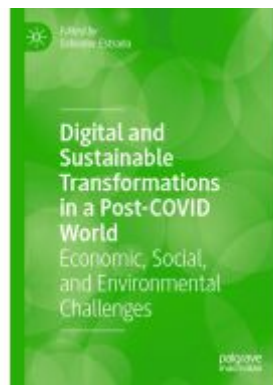
Digital and Sustainable Transformations in a Post-COVID World Ladenpreis: 186,99EUR