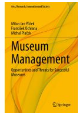
Museum Management Ladenpreis: 54,99EUR