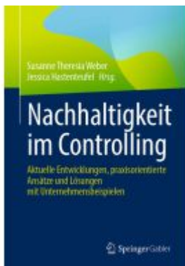
Nachhaltigkeit im Controlling Ladenpreis: 61,67EUR