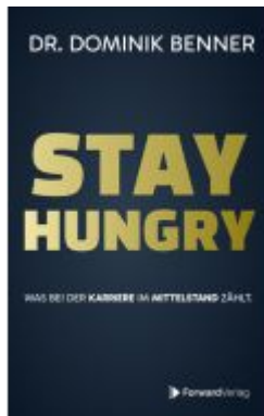
Stay Hungry Ladenpreis: 25,00EUR

Wir haben andere Produkte gefunden, die Ihnen gefallen könnten!