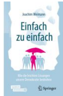
Einfach zu einfach Ladenpreis: 28,77EUR