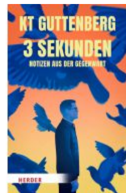
3 Sekunden Ladenpreis: 16,50EUR