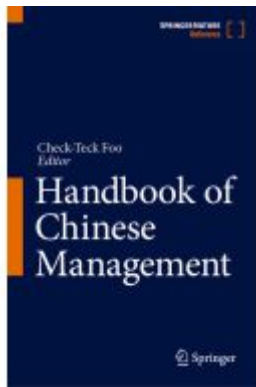
Handbook of Chinese Management Ladenpreis: 439,99EUR