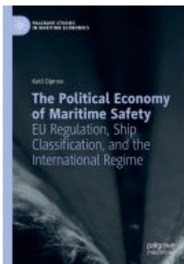
The Political Economy of Maritime Safety Ladenpreis: 142,99EUR