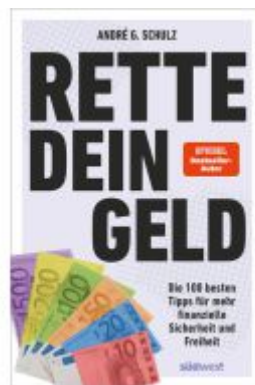
Rette dein Geld Ladenpreis: 18,50EUR