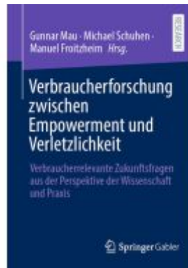
Verbraucherforschung zwischen Empowerment und Verletzlichkeit Ladenpreis: 92,51EUR