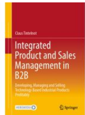
Integrated Product and Sales Management in B2B Ladenpreis: 76,99EUR