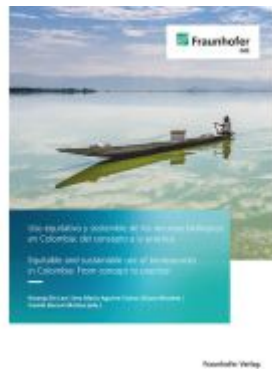
Uso equitativo y sostenible de los recursos biológicos en Colombia: del concepto a la práctica Ladenpreis: 91,50EUR