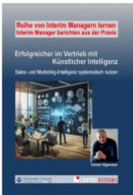
Erfolgreicher im Vertrieb mit Künstlicher Intelligenz Ladenpreis: 29,00EUR