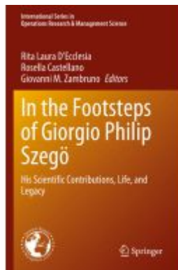
In the Footsteps of Giorgio Philip Szegö Ladenpreis: 197,99EUR