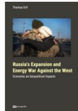
Russia's expansion and energy war against the West Ladenpreis: 23,50EUR