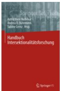
Handbuch Intersektionalitätsforschung Ladenpreis: 154,20EUR