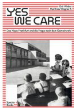
Yes, we care Ladenpreis: 32,90EUR