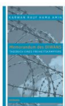
Memorandum des Diwans Ladenpreis: 18,50EUR