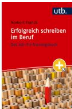
Erfolgreich schreiben im Beruf Ladenpreis: 22,70EUR

Wir haben andere Produkte gefunden, die Ihnen gefallen könnten!