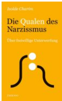
Die Qualen des Narzissmus Ladenpreis: 24,70EUR