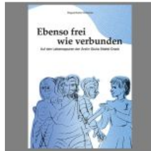
Ebenso frei wie verbunden Ladenpreis: 22,70EUR