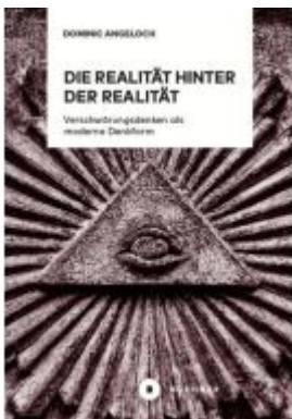
Die Realität hinter der Realität Ladenpreis: 25,00EUR