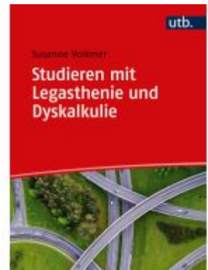
Studieren mit Legasthenie und Dyskalkulie Ladenpreis: 25,60EUR