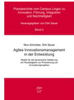
Agiles Innovationsmanagement in der Entwicklung Ladenpreis: 29,90EUR