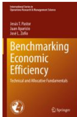
Benchmarking Economic Efficiency Ladenpreis: 153,99EUR