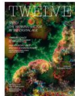
TWELVE 2023 Ladenpreis: 18,50EUR