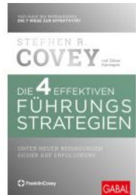
Die 4 effektiven Führungsstrategien Ladenpreis: 30,80EUR