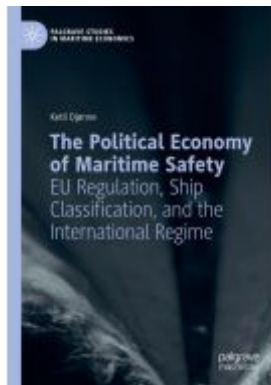
The Political Economy of Maritime Safety Ladenpreis: 142,99EUR