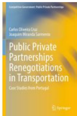
Public Private Partnerships Renegotiations in Transportation Ladenpreis: 131,99EUR