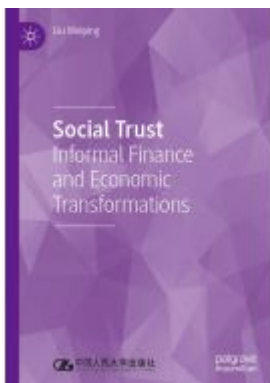
Social Trust Ladenpreis: 153,99EUR