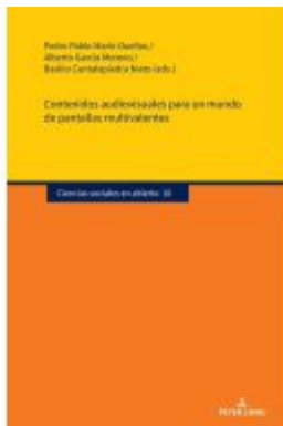
Contenidos audiovisuales para un mundo de pantallas multivalentes Ladenpreis: 87,30EUR