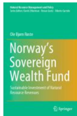
Norway's Sovereign Wealth Fund Ladenpreis: 120,99EUR