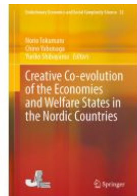
Creative Co-evolution of the Economies and Welfare States in the Nordic Countries Ladenpreis: 186,99EUR