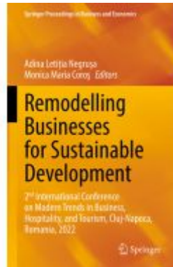
Remodelling Businesses for Sustainable Development Ladenpreis: 219,99EUR