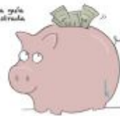
Dinero para principiantes Ladenpreis: 12,40EUR