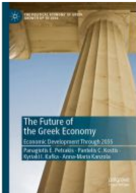
The Future of the Greek Economy Ladenpreis: 120,99EUR

Wir haben andere Produkte gefunden, die Ihnen gefallen könnten!