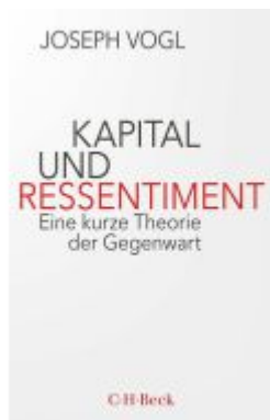
Kapital und Ressentiment Ladenpreis: 16,50EUR