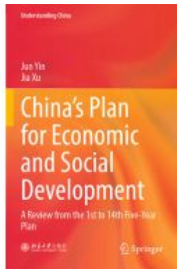
China's Plan for Economic and Social Development Ladenpreis: 109,99EUR