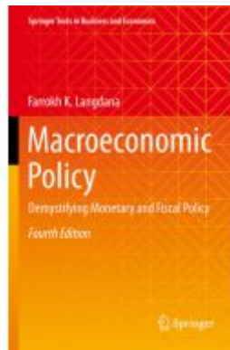
Macroeconomic Policy Ladenpreis: 71,49EUR