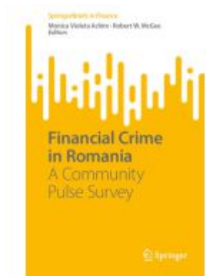
Financial Crime in Romania Ladenpreis: 54,99EUR