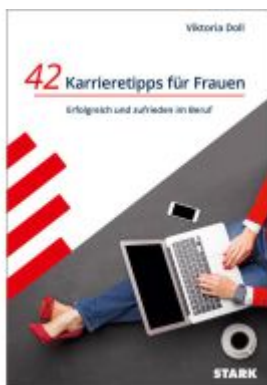
STARK 42 Karrieretipps für Frauen - Erfolgreich und zufrieden im Beruf Ladenpreis: 23,95EUR