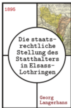
Die staatsrechtliche Stellung des Statthalters in Elsass-Lothringen Ladenpreis: 14,90EUR

Wir haben andere Produkte gefunden, die Ihnen gefallen könnten!