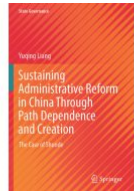
Sustaining Administrative Reform in China Through Path Dependence and Creation Ladenpreis: 131,99EUR