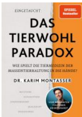
Eingetaucht: Das Tierwohl-Paradox Ladenpreis: 13,30EUR