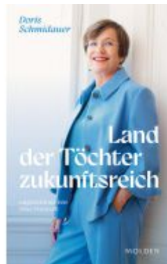
Land der Töchter zukunftsreich Ladenpreis: 26,00EUR