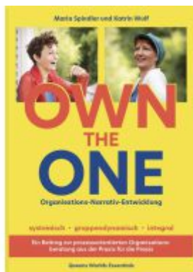
OWN THE ONE Organisations-Narrativ- Entwicklung Ladenpreis: 20,00EUR