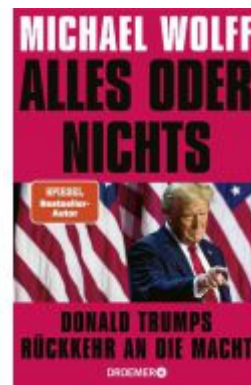
Alles oder nichts Ladenpreis: 28,80EUR