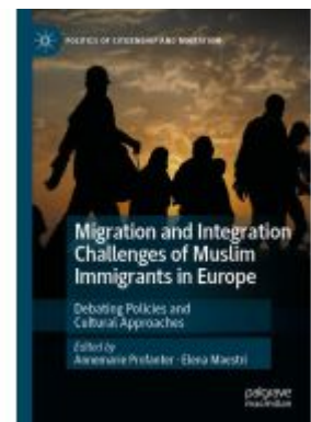
Migration and Integration Challenges of Muslim Immigrants in Europe Ladenpreis: 142,99EUR