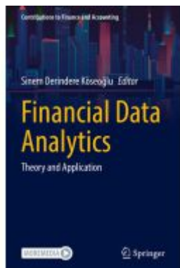
Financial Data Analytics Ladenpreis: 186,99EUR

Wir haben andere Produkte gefunden, die Ihnen gefallen könnten!