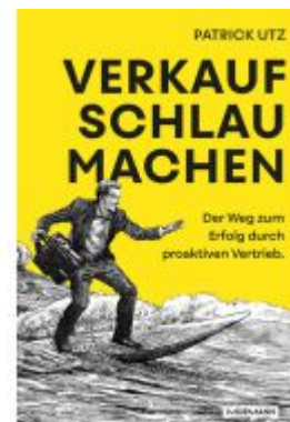
Verkauf. Schlau. Machen. Ladenpreis: 29,80EUR