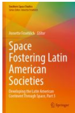
Space Fostering Latin American Societies Ladenpreis: 153,99EUR