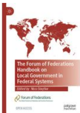
The Forum of Federations Handbook on Local Government in Federal Systems Ladenpreis: 153,99EUR