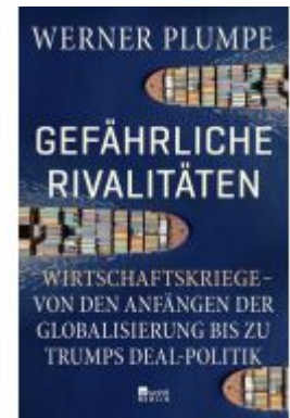
Gefährliche Rivalitäten Ladenpreis: 25,70EUR