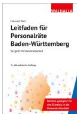
Leitfaden für Personalräte Baden- Württemberg Ladenpreis: 36,00EUR