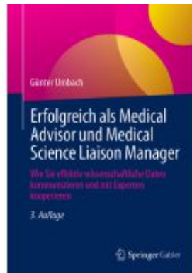
Erfolgreich als Medical Advisor und Medical Science Liaison Manager Ladenpreis: 82,23EUR