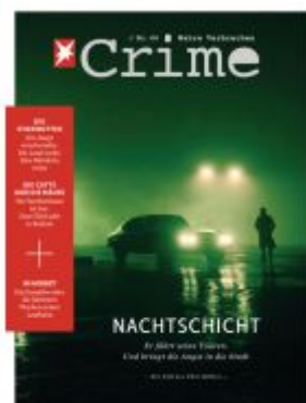
stern Crime - Wahre Verbrechen Ladenpreis: 7,10EUR