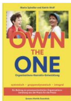
OWN THE ONE Organisations-Narrativ- Entwicklung Ladenpreis: 20,00EUR