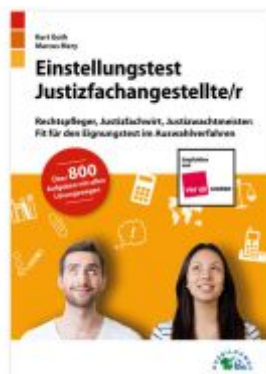
Einstellungstest Justizfachangestellter Ladenpreis: 19,50EUR