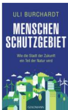
Menschenschutzgebiet Ladenpreis: 22,70EUR