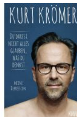
Du darfst nicht alles glauben, was du denkst Ladenpreis: 13,40EUR