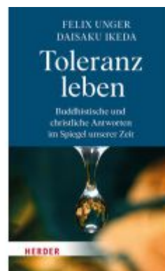
Toleranz leben Ladenpreis: 20,60EUR