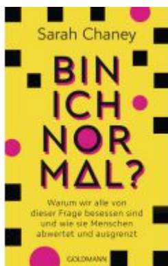
Bin ich normal? Ladenpreis: 18,50EUR