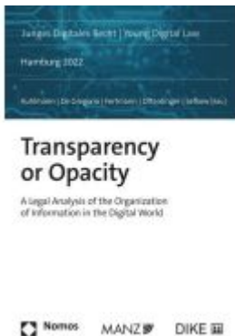
Transparency or Opacity A Legal Analysis of the Organization of Information in the Digital World Ladenpreis: 74,00EUR