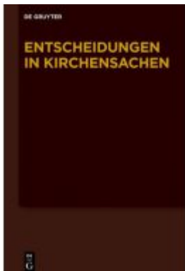
Entscheidungen in Kirchensachen seit 1946 / 01.01.2021–30.06.2021 Ladenpreis: 209,00EUR