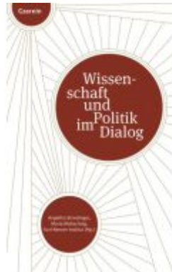
Wissenschaft und Politik im Dialog Ladenpreis: 20,00EUR