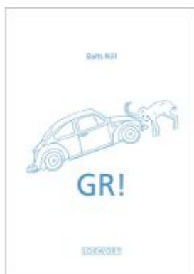
GR! Ladenpreis: 8,00EUR