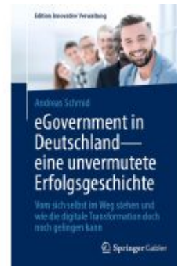
eGovernment in Deutschland - eine unvermutete Erfolgsgeschichte Ladenpreis: 71,95EUR