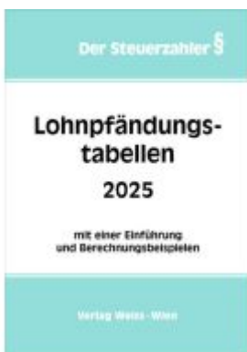
Lohnpfändungstabellen 2025 Ladenpreis: 27,50EUR