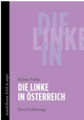
Die Linke in Österreich Ladenpreis: 14,00EUR