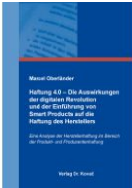
Haftung 4.0 – Die Auswirkungen der digitalen Revolution und der Einführung von Smart Products auf die Haftung des Herstellers Ladenpreis: 143,80EUR