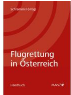
Flugrettung in Österreich Ladenpreis: 58,00EUR