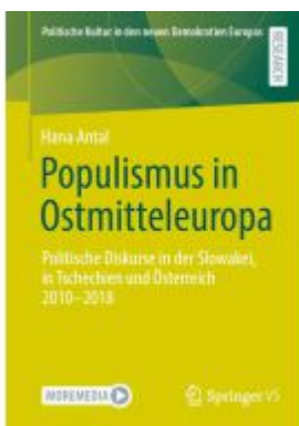
Populismus in Ostmitteleuropa Ladenpreis: 102,79EUR