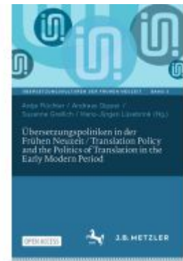
Übersetzungspolitiken in der Frühen Neuzeit / Translation Policy and the Politics of Translation in the Early Modern Period Ladenpreis: 43,99EUR