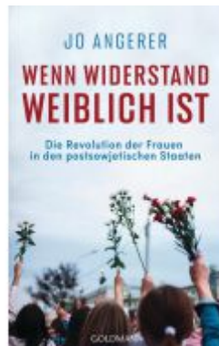
Wenn Widerstand weiblich ist Ladenpreis: 22,70EUR