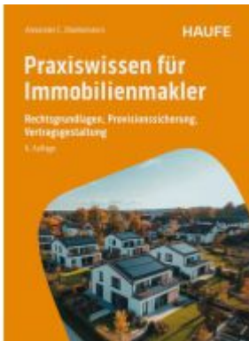
Praxiswissen für Immobilienmakler Ladenpreis: 51,40EUR