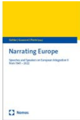
Narrating Europe Ladenpreis: 122,40EUR