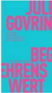
Begehrenswert Ladenpreis: 16,50EUR