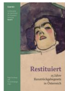
Restituiert Ladenpreis: 40,00EUR