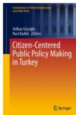
Citizen-Centered Public Policy Making in Turkey Ladenpreis: 142,99EUR