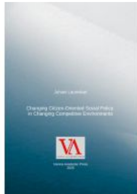
Changing Citizen-Oriented Social Policy in Changing Competitive Environments Ladenpreis: 29,50EUR