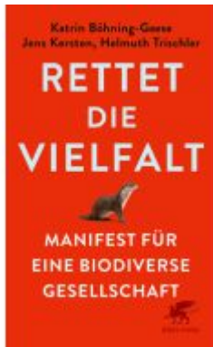
Rettet die Vielfalt Ladenpreis: 20,60EUR