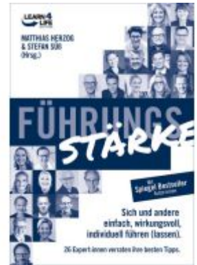
FührungsStärke Ladenpreis: 20,50EUR