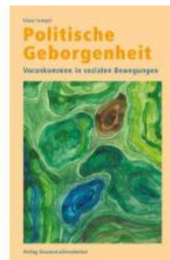
Politische Geborgenheit Ladenpreis: 20,50EUR