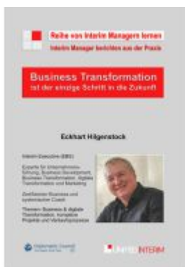
Business Transformation ist der einzige Weg in die Zukunft Ladenpreis: 25,70EUR