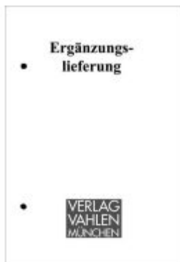
Ertragsteuerrecht 179. Ergänzungslieferung Ladenpreis: 81,30EUR

Wir haben andere Produkte gefunden, die Ihnen gefallen könnten!