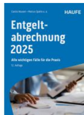
Entgeltabrechnung 2025 Ladenpreis: 61,70EUR