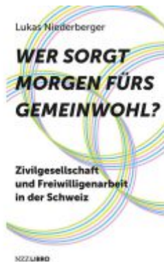
Wer sorgt morgen fürs Gemeinwohl? Ladenpreis: 28,80EUR