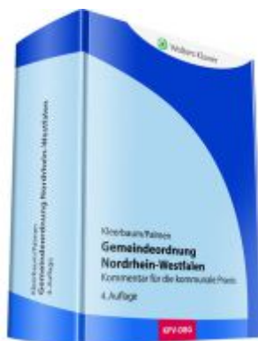
Gemeindeordnung Nordrhein-Westfalen Ladenpreis: 100,80EUR