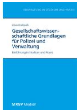
Gesellschaftswissenschaftliche Grundlagen für Polizei und Verwaltung Ladenpreis: 25,70EUR