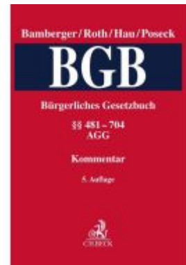
Bürgerliches Gesetzbuch Band 2: §§ 481-704, AGG Ladenpreis: 194,30EUR