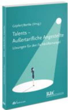
Talents - Außertarifliche Angestellte Ladenpreis: 50,40EUR