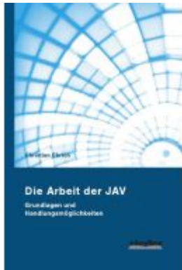
Die Arbeit der JAV Ladenpreis: 24,70EUR