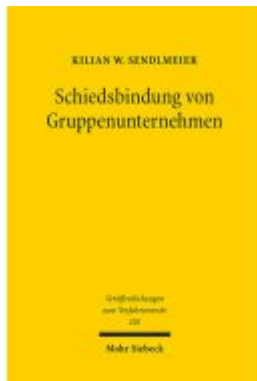
Schiedsbindung von Gruppenunternehmen Ladenpreis: 91,50EUR

Wir haben andere Produkte gefunden, die Ihnen gefallen könnten!