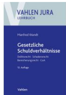
Gesetzliche Schuldverhältnisse Ladenpreis: 30,90EUR