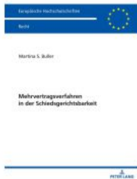
Mehrvertragsverfahren in der Schiedsgerichtsbarkeit Ladenpreis: 56,50EUR