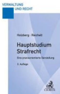
Hauptstudium Strafrecht Ladenpreis: 27,70EUR